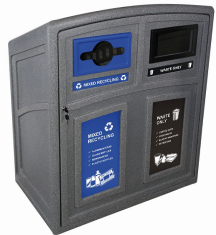
Optional labels available