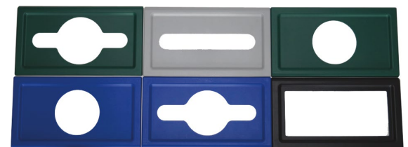
Variety of lid openings & stamping options