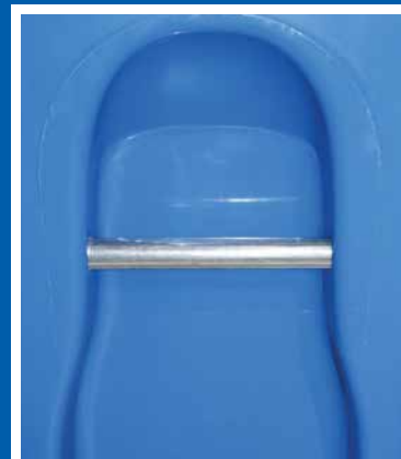
Metal lift bar