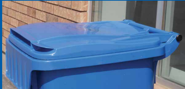
Contoured lid reduces warp and pooling water